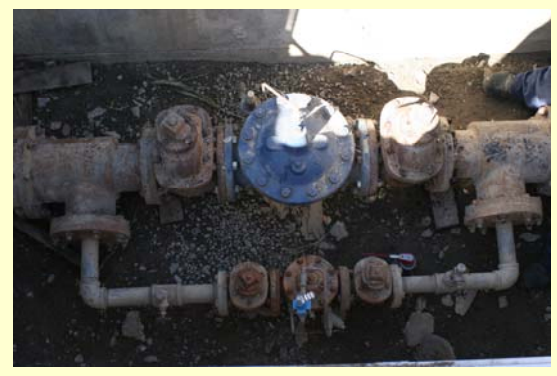
New Pressure Reducing Valve replaced by staff